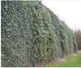
GRAMM ECOSoundBlok with trailing ivy